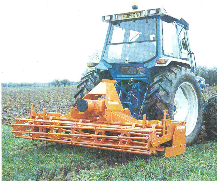
▼ HK30/300 shown with Crumble Roller.