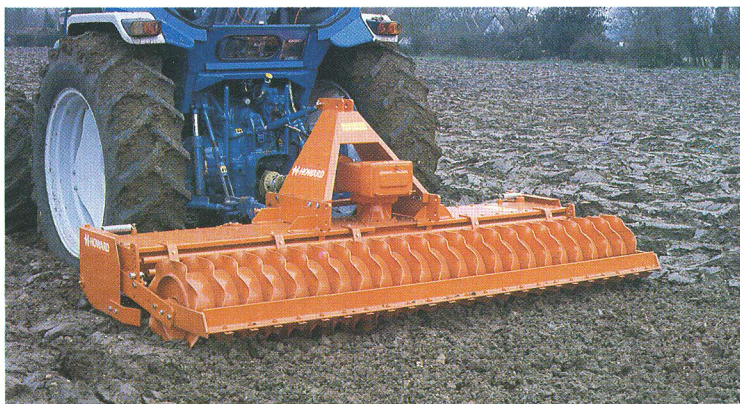
▲ HK20/300 fitted with Packer Roller.